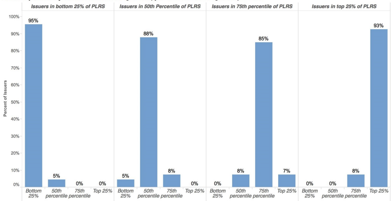
Percent of Issuers by Claims Paid Amount Quartiles, for Each Risk Score Quartile, BY2015