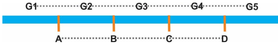
Figure J-1: Diagram showing gaps in data where cut points are assigned

As mentioned, the cut points are used to create five non-overlapping groups. The value of the lower bound for each group is included in the category, while the value of the upper bound is not included in the category. CMS does not require the same number of observations (contracts) within each group. The groups are identified such that within a group the measure scores must be similar to each other and between groups, the measure scores in one group are not similar to measures scores in another group. The groups are then used for the conversion of the measure scores to one of five Star Ratings categories. For most measures, a higher score is better, and thus, the group with the highest range of measure scores is converted to a rating of five stars. An example of a measure for which higher is better is Medication Adherence for Diabetes Medications . For some measures a lower score is better, and thus, the group with the lowest range of measures scores is converted to a rating of five stars. An example of a measure for which a lower score is better is Members Choosing to Leave the Plan .