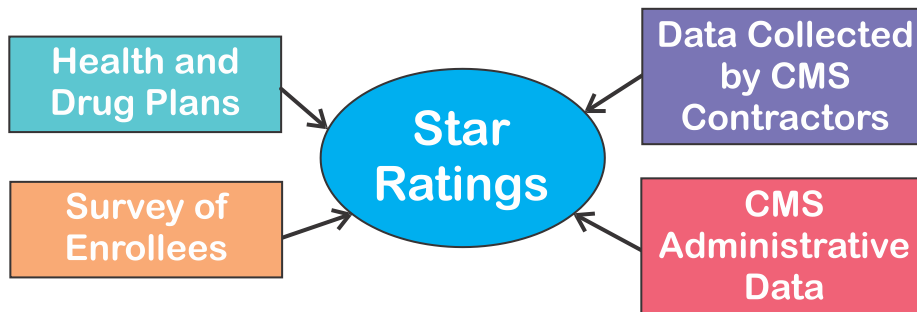
Figure 2: The Four Categories of Data Sources

The data used in the Star Ratings come from four categories of data sources which are shown in Figure 2.