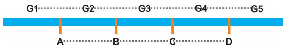
Figure J-1: Diagram showing gaps in data where cut points are assigned

As mentioned, the cut points are used to create five non-overlapping groups. The value of the lower bound for each group is included in the category, while the value of the upper bound is not included in the category. CMS does not require the same number of observations (contracts) within each group. The groups are identified such that within a group the measure scores must be similar to each other and between groups, the measure scores in one group are not similar to measure scores in another group. The groups are then used for the conversion of the measure scores to one of five Star Ratings categories. For most measures, a higher score is better, and thus, the group with the highest range of measure scores is converted to a rating of five stars. An example of a measure for which higher is better is Medication Adherence for Diabetes Medications . For some measures a lower score is better, and thus, the group with the lowest range of measure scores is converted to a rating of five stars. An example of a measure for which a lower score is better is Members Choosing to Leave the Plan .