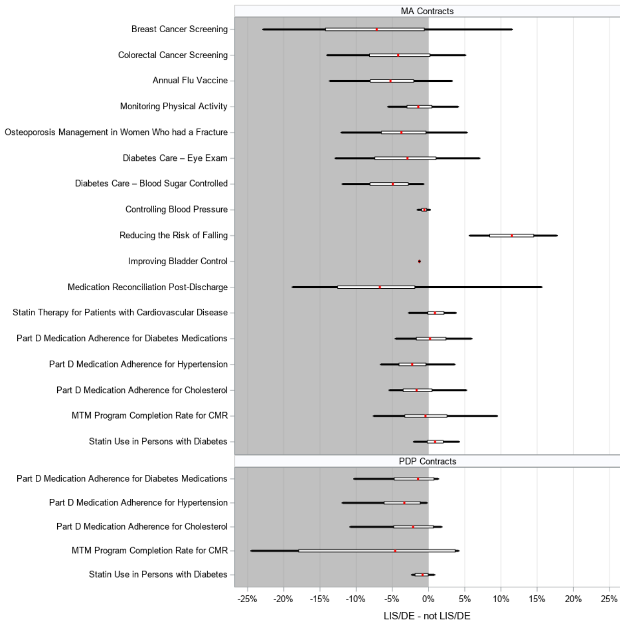
Figure 1: Distribution of Within-Contract LIS/DE Differences in Performance across MA and PDP Contracts

Figure 1 shows distributions of within-contract LIS/DE and non-LIS/DE differences in performance for the contracts that received a measure Star Rating. The shaded area corresponds to worse performance for LIS/DE beneficiaries, and the non-shaded area corresponds to better performance for LIS/DE beneficiaries, relative to non-LIS/DE beneficiaries. Distributions of the within-contract differences are provided first for MA contracts, followed by PDPs.